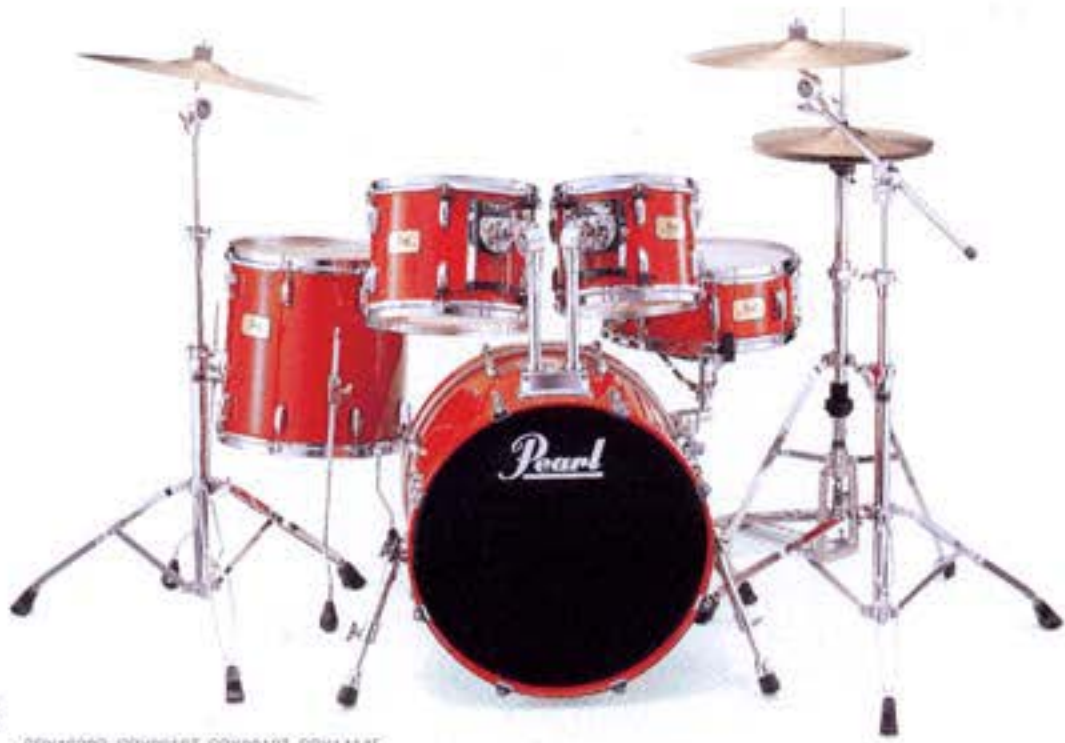
#288 Burnt Amber

Drums : SRX1822B, SRX0810T, SRX0912T, SRX1214T Snare Drum : SRX5514S Hardware : H-855, P-101P, S-850, C-855W, B-855W Accessories : TH-98I (2), TH-98S, AX-20