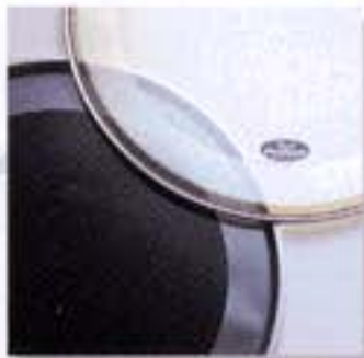
Pearl ProTone Heads

All Session Custom SRX bass drums feature our SP-30 telescoping bass drum spurs. Designed for the professional drummer, the SP-30 spur is extremely quick to position, easy to adjust, and with its quarter turn spike to rubber tipped feet, it offers the absolute ultimate in stability on most any playing surface.