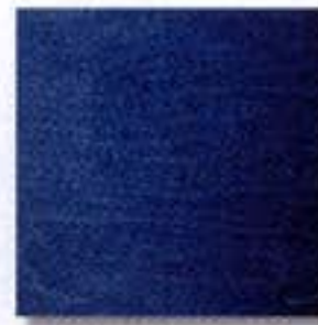
#285 Dusk Blue