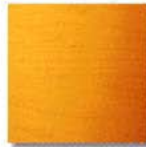
#287 Topaz Mist