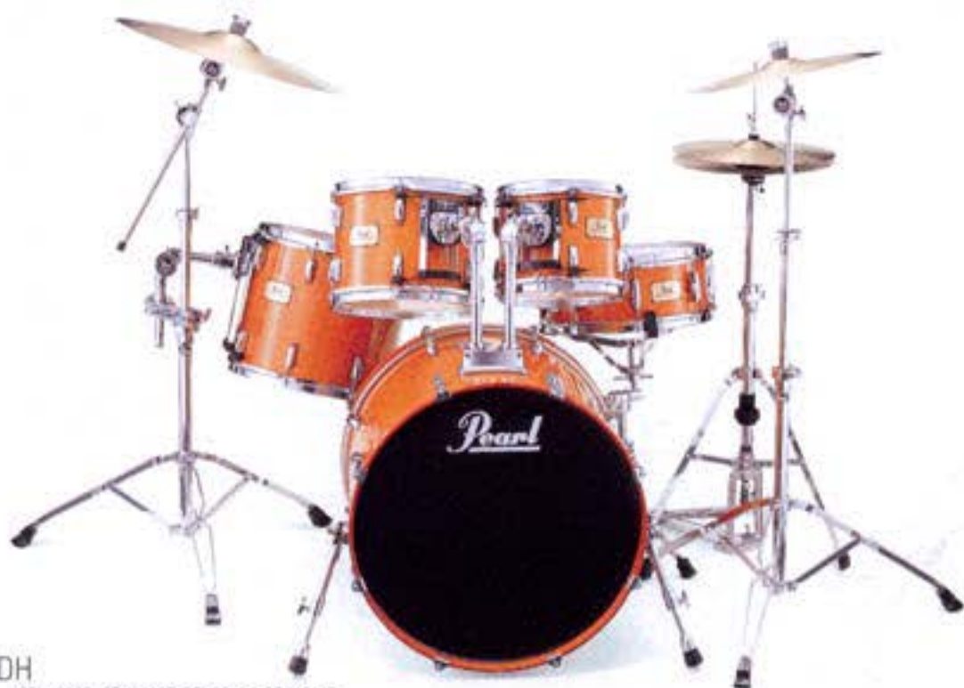
#287 Topaz Mist

Drums : SRX1622B, SRX1012T, SRX1113T, SRX1616F Snare Drum : SRX5514S Hardware : H-855, P-101P, S-850, C-855W, B-855W Accessories : TH-98I (2)