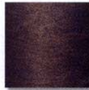
#281 Carbon Mist