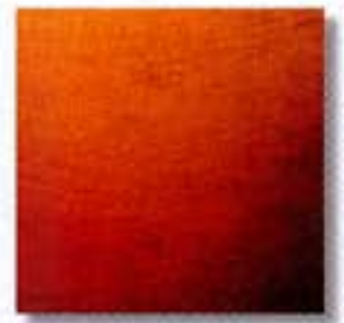
#290 Vintage Fade