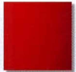
#286 Cranberry Mist