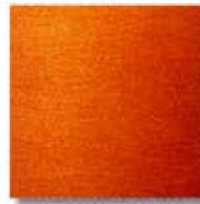
#288 Burnt Amber